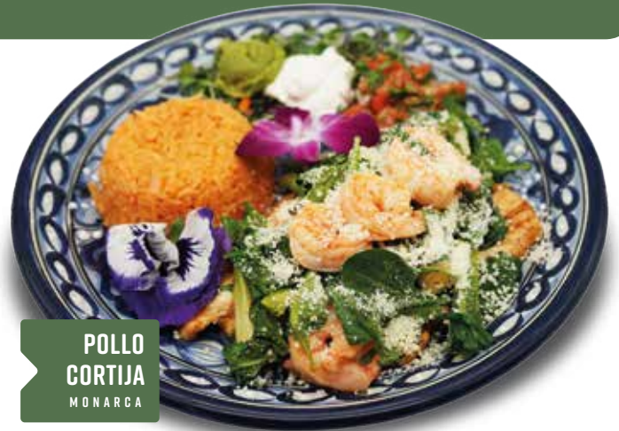
POLLO CORTIJA MONARCA

Griddle Corn on or off the cobb smothered in Butter, Mayo, Cotija Cheese & Tajin.