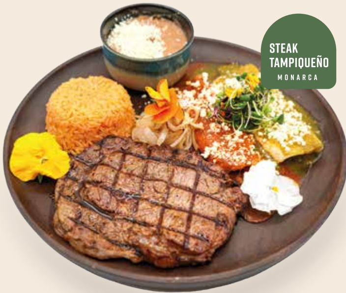
STEAK TAMPIQUEÑO MONARCA