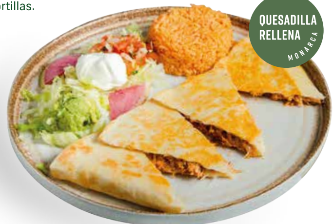
QUESADILLA RELLENA MONARCA

A crispy Tortilla bowl filled with choice of Shredded Chicken or Beef, Lettuce, Tomatoes, Shredded Cheese & Sour Cream.