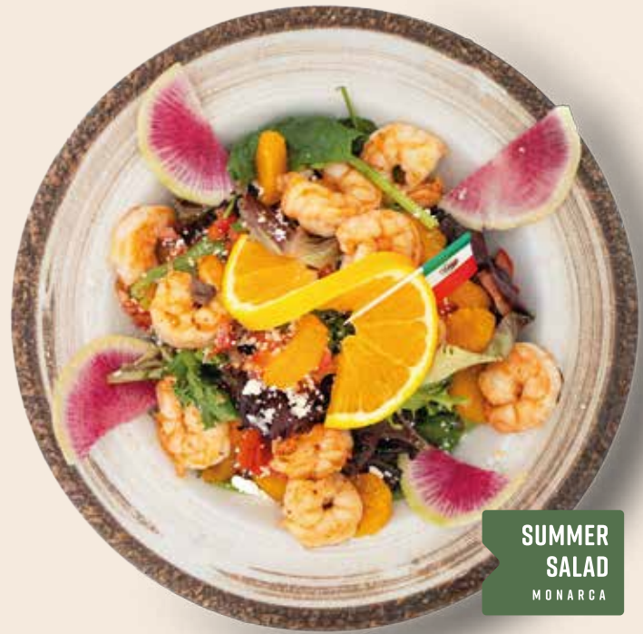
SUMMER SALAD MONARCA

A crispy Flour Tortilla Shell with Onions, Bell Peppers topped with Nacho Cheese, Beans, Lettuce, Tomatoes, Guacamole & Sour Cream. Choice of: Grilled Chicken or Steak.